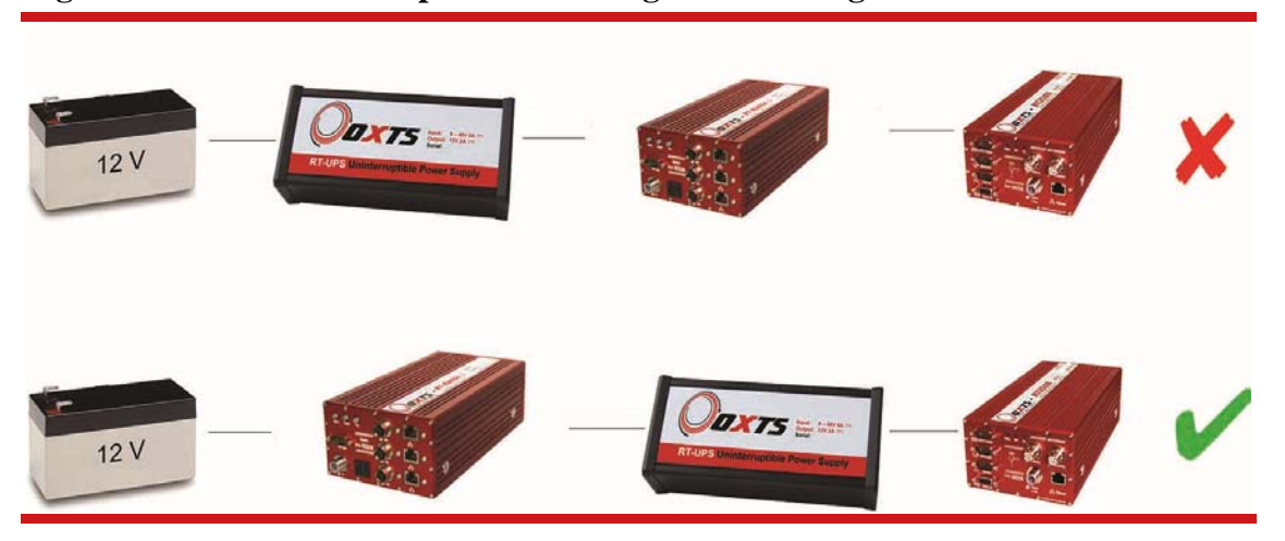
Figure 4. Connection set-up with RT-Range or RT-Range S

When using the RT-UPS with RT-Range S or standard RT-Range products, care should be taken when connecting the systems. The RT-UPS should be connected between the RT-Range Hunter system and the RT. It should not be connected between the power supply and the RT-Range Hunter system as the current draw will be too much and may damage the RT-UPS. Figure 4 illustrates the correct connection set up.